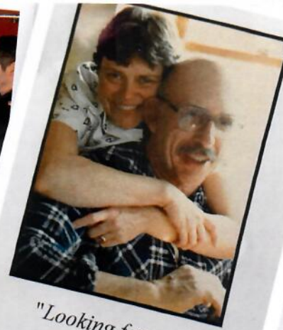
"Looking forward to our heavenly reunion."